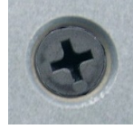
Coarse thread 1" drywall screws.

After removal of old kick back, for best results, remove high spots in wood kick back and repair excessively low or damaged areas with suitable filler.